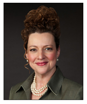
President and CEO